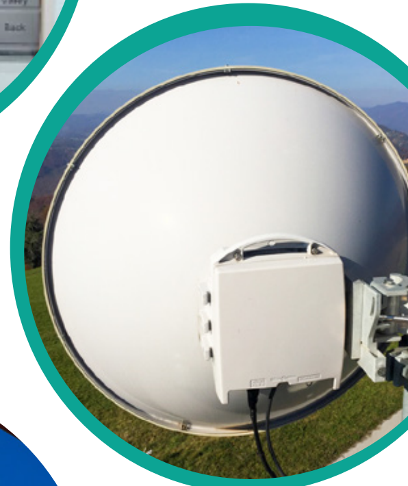
Microwave Link Design & Installations