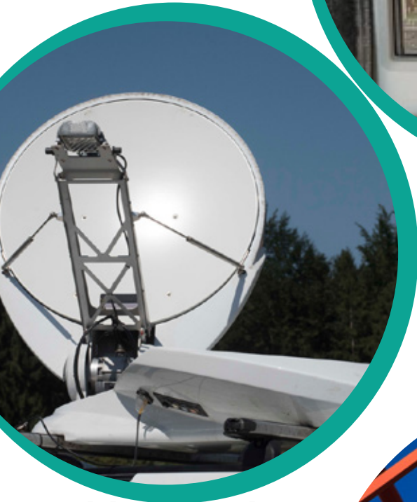
Outside Broadcast Vehicle Equipage