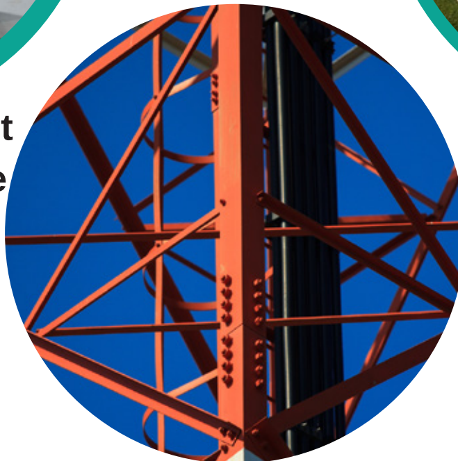
Mast Design & Installation